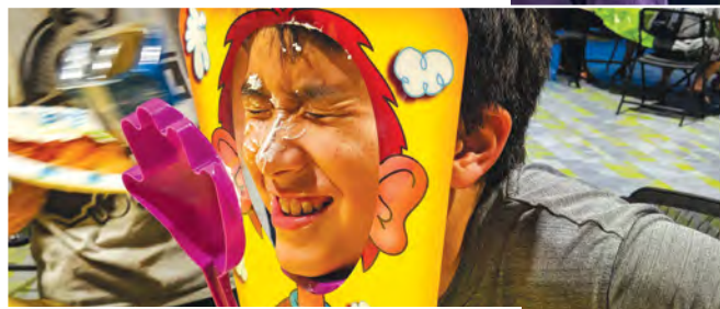
Family Game Night provides lots of laughs at the Downtown Campus