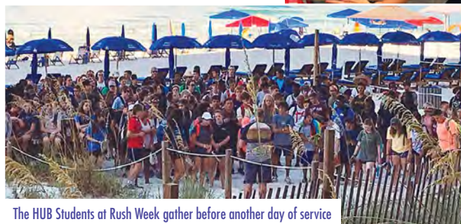
The HUB Students at Rush Week gather before another day of service