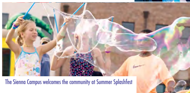
The Sienna Campus welcomes the community at Summer Splashfest