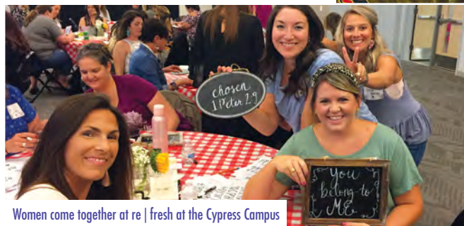
Women come together at re | fresh at the Cypress Campus