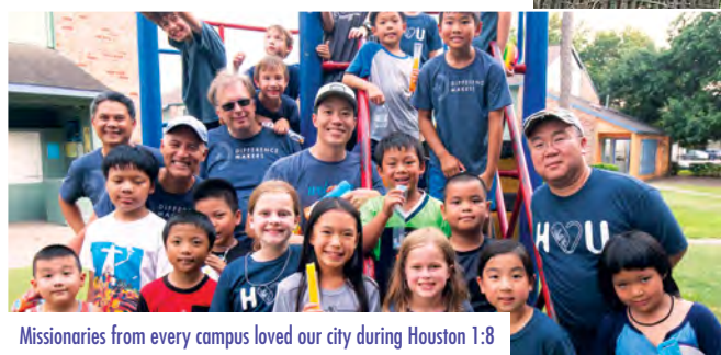
Missionaries from every campus loved our city during Houston 1:8