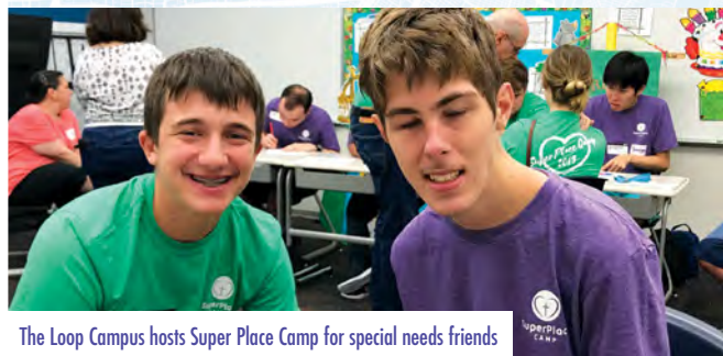
The Loop Campus hosts Super Place Camp for special needs friends