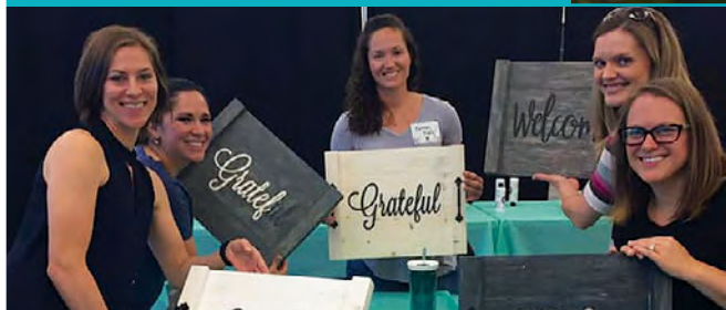
Cypress women make custom creations at the refresh woodshop workshop