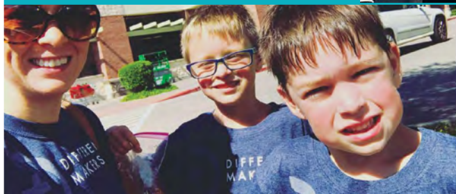
Houston's First family members spotted around town in Difference Maker T-shirts