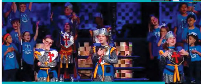
Kids at the Spring Weekend of Choir present their musical at The Loop Campus