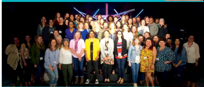
Women gather for the Age of Crowns conference at the Downtown Campus