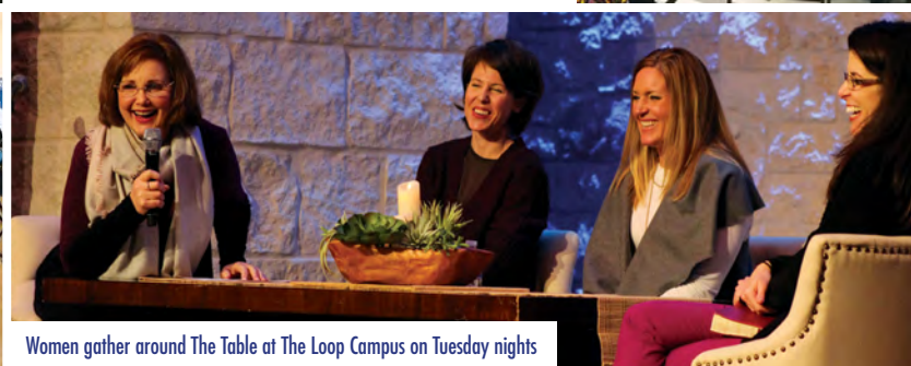
Women gather around The Table at The Loop Campus on Tuesday nights