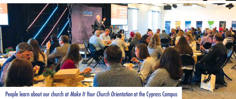
People learn about our church at Make It Your Church Orientation at the Cypress Campus