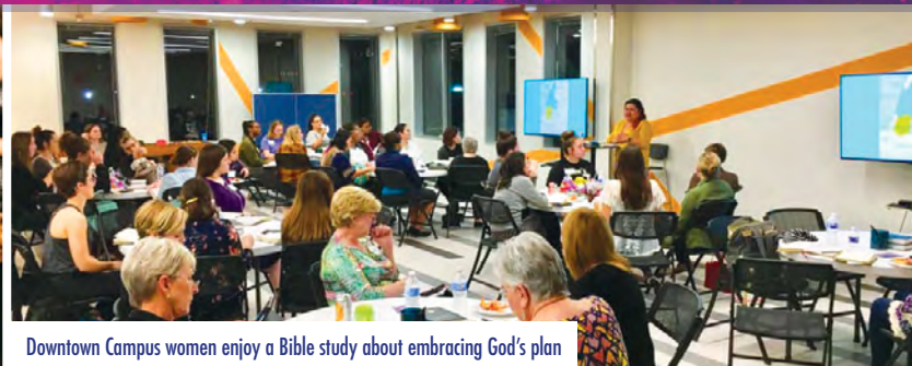
Downtown Campus women enjoy a Bible study about embracing God's plan