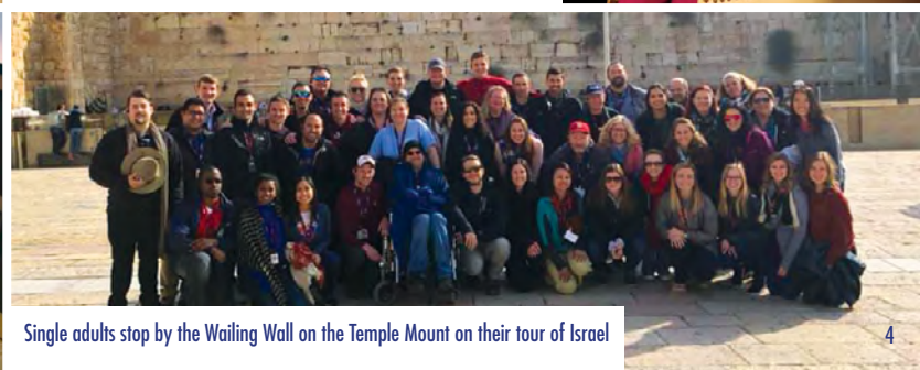
Single adults stop by the Wailing Wall on the Temple Mount on their tour of Israel