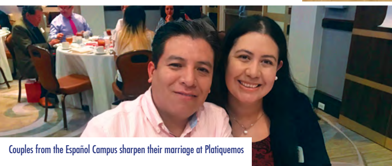
Couples from the Español Campus sharpen their marriage at Platiqemos