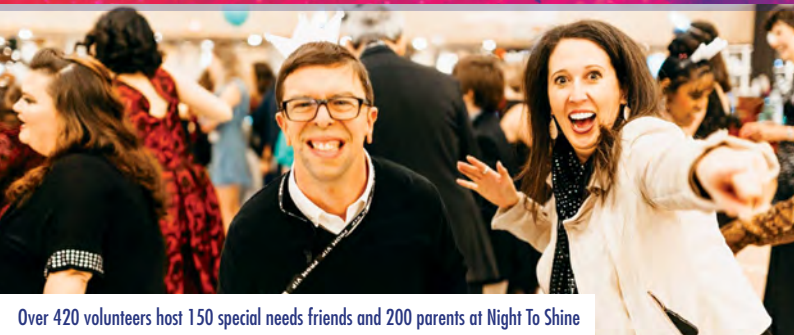
Over 420 volunteers host 150 special needs friends and 200 parents at Night To Shine