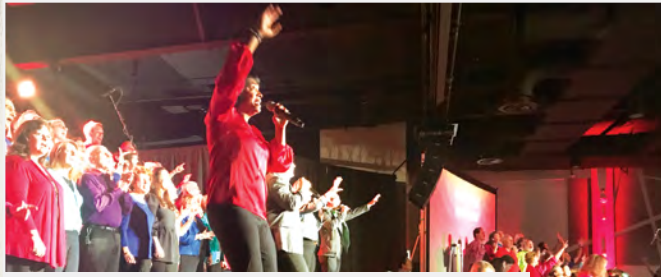
The Choir & Orchestra from The Loop lead worship at the Downtown Campus