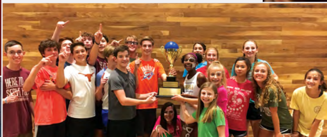
The HUB Students conquer indoor dodgeball at the Cypress Campus