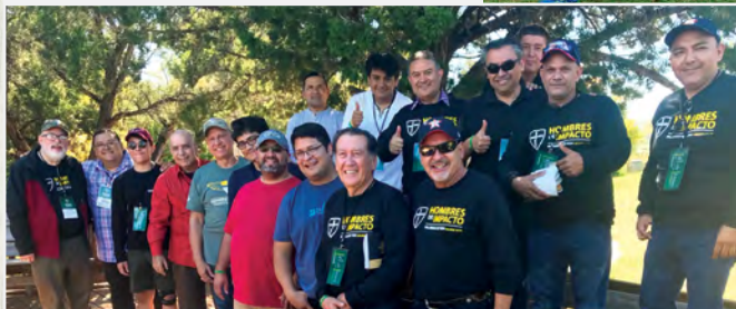
Men from Español Campus attend SBTC's Hombres de Impacto conference