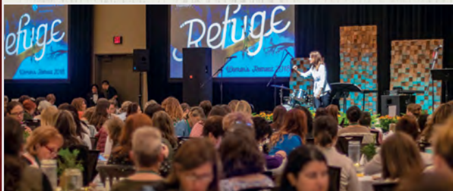
Women from every campus gather for Refuge, a churchwide women's retreat