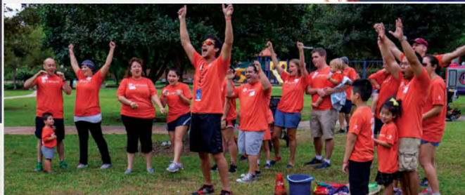
Adoptive and foster families celebrate 10 years of Legacy685