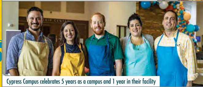
Cypress Campus celebrates 5 years as a campus and 1 year in their facility