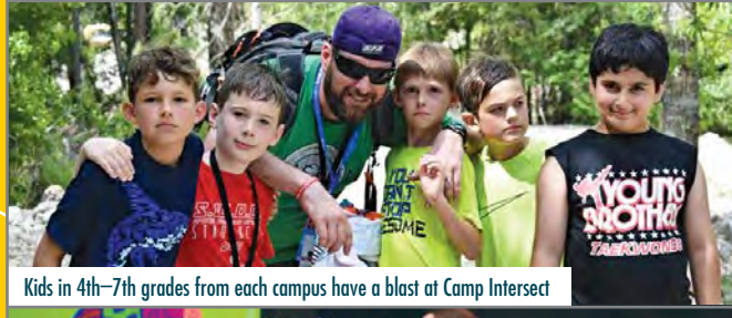
Kids in 4th–7th grades from each campus have a blast at Camp Intersect