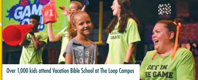
Over 1,000 kids attend Vacation Bible School at The Loop Campus