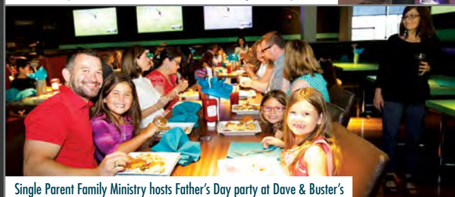
Single Parent Family Ministry hosts Father's Day party at Dave & Buster's