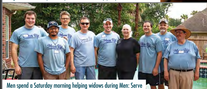
Men spend a Saturday morning helping widows during Men: Serve