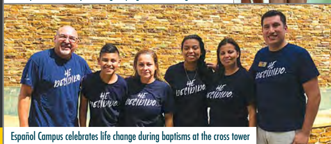
Español Campus celebrates life change during baptisms at the cross tower