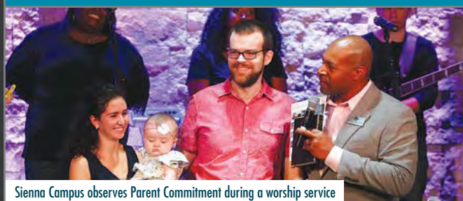
Sienna Campus observes Parent Commitment during a worship service