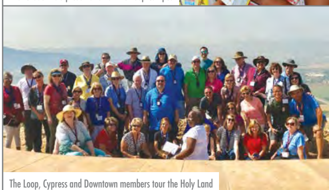
The Loop, Cypress and Downtown members tour the Holy Land