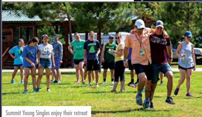
Summit Young Singles enjoy their retreat