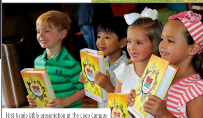
First Grade Bible presentation at The Loop Campus