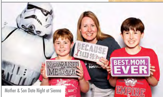
Mother & Son Date Night at Sienna