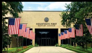
The Loop & Español Campuses