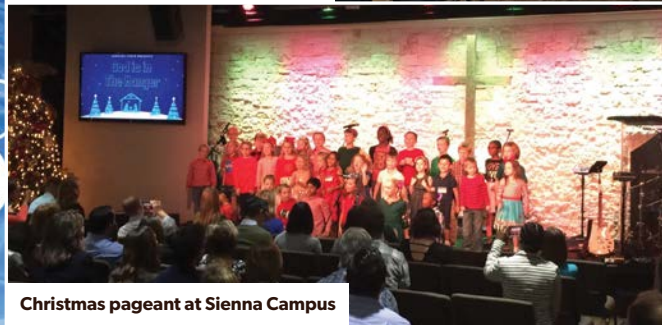
Christmas pageant at Sienna Campus