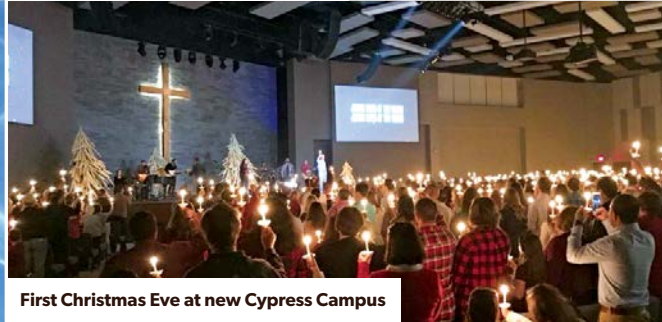
First Christmas Eve at new Cypress Campus