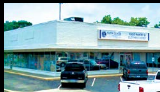
Food Pantry & Clothes Closet