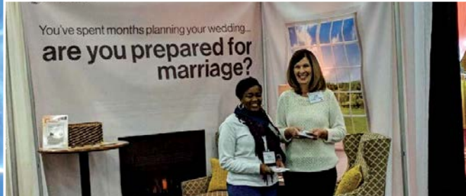
Married Young Adult ministry at Bridal Extravaganza