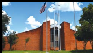
Woodhaven Baptist Deaf Church