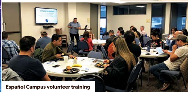
Español Campus volunteer training