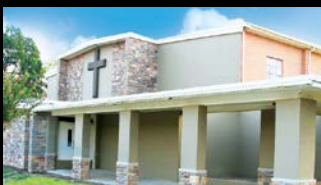
Faith Center-Spring Branch