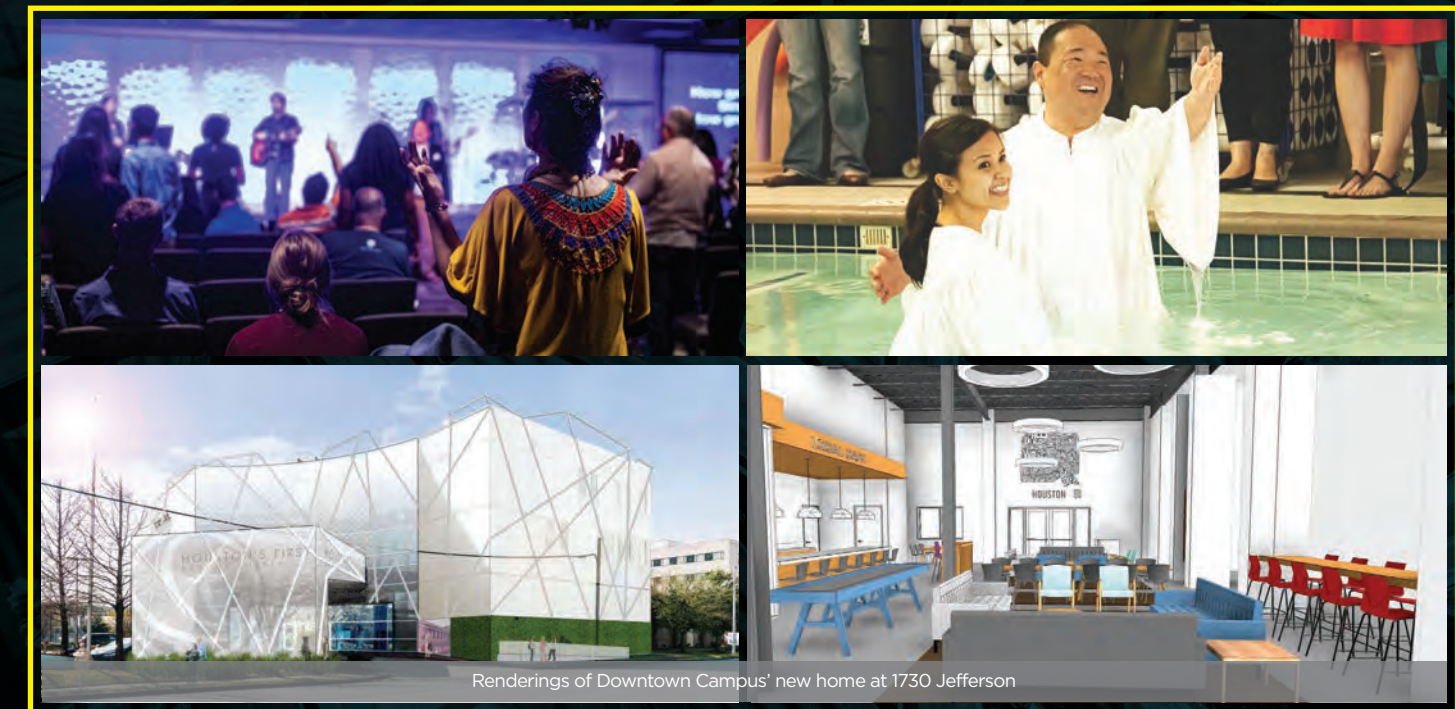
Renderings of Downtown Campus' new home at 1730 Jefferson