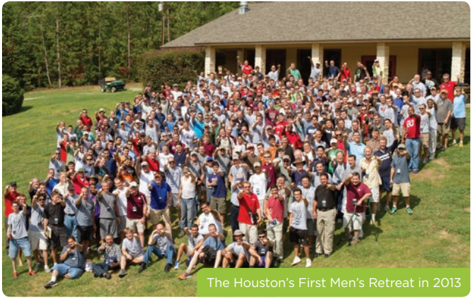
The Houston's First Men's Retreat in 2013

Hosted by the Waiting in Hope ministry, You Are Not Alone is an evening of support and encouragement for couples facing infertility. The event is free with dinner at 6p and the program beginning at 6:30p with topical discussions, personal heartfelt stories filled with hope, and tools to leave you renewed during a difficult season. Couples are encouraged to attend together, but husbands and wives are welcome to attend on their own. Register at HoustonFirst.org/Events or contact waitinginhopehfb@gmail.com or 713.957.7641 for more information about the event or Waiting In Hope.