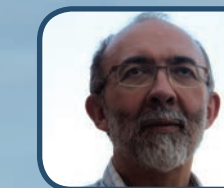
Thank you, thank you, thank you! Miguel Fernández Evangelical Baptist Church of Xátiva IEBXativa.com

There are only 4 evangelical primary schools in all of Spain with Bethany being one of those. Help us raise up new generations in the west of Spain to follow Christ, who is the only one who can change lives!