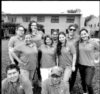
Faith Center–Spring Branch